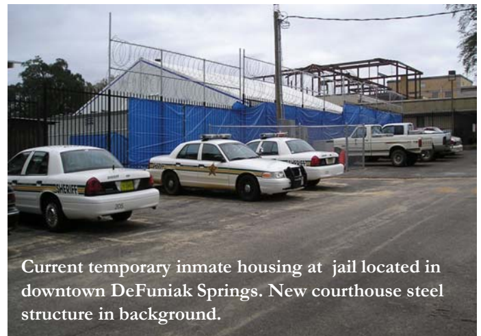
Current temporary inmate housing at jail located in downtown DeFuniak Springs. New courthouse steel structure in background.