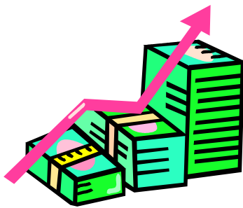
Up, Up, and awayyyyyyyyy!

In exchange for voter approval, the school board committed to decrease the capital tax levy by ½ mil. They have maintained the decrease for the past four years, resulting in an overall transparent effect to taxpayers.